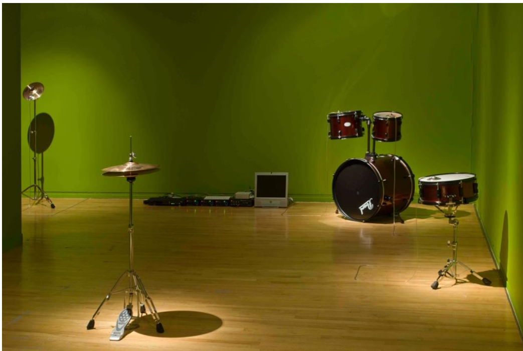
Figure 4 – I play the drums with frequency . Disponible, a kind of a Mexican Show School of the Museum of Fine Arts (Boston).

In this work, the five drums play their first sound at the same time only at the beginning. This never happens again; the drums will always be playing out of phase with each other. An enormous number of combinations of the 35 different sounds and silences can be listened to at any moment. But amazingly, thanks to the ingredients quantities (the different sets of durations), a randomly synchronic silence happens occasionally on all the drums. Also, the occasionally beating sounds and the even less occasionally klangfarben melodies that happen every 4 sounds and silences in every drum cycle, offer both an interesting contrasting element. The result is an infinite music, it is always the same open work, very recognizable even when performed in different drum sets with different tunings and timbers, but it is always the same structure with a huge number of permutations.