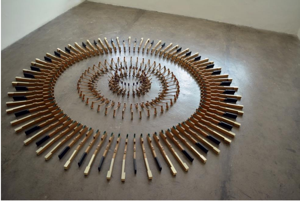
Figure 5 – Transmutación . Le Laboratoire Gallery, Mexico City 2016.