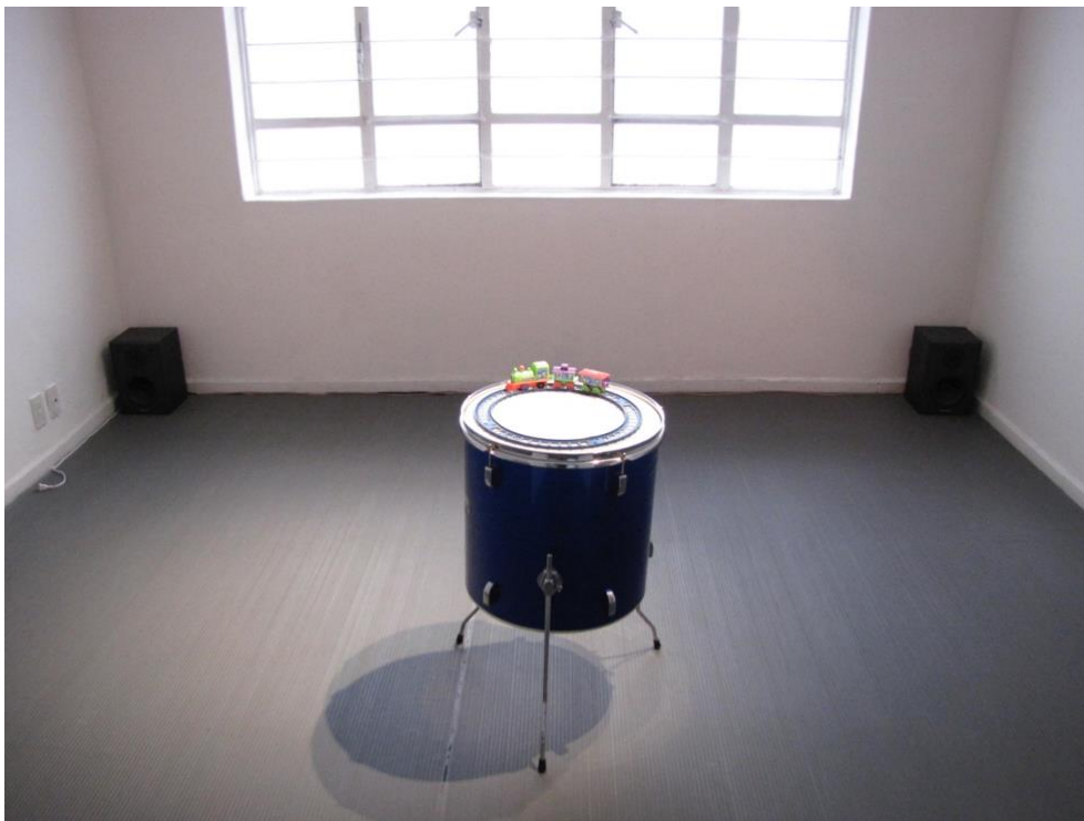
Figure 1 – El eterno retorno . Le Laboratoire Galery, Mexico City, 2014.

bodies. But in some Hinduism philosophy's as in the Samkhya school, the universe is seen as part of two eternal realities: purusha and prakrti . It is a dualist philosophy characterized by a way to see life in the universe as an evolution of different dualities (light-darkness, masculine-feminine, etc.). The spirit as an autonomous principle is transcendent and accepted by all the Indian philosophies, except for Buddhism and Materialism.